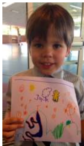
Jack drew his very own picture without any assistance!