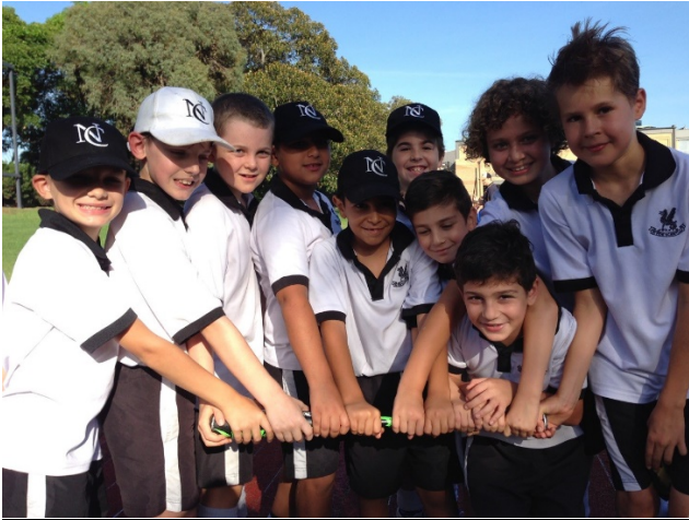
Wyvern's champion Teeball Team from last Saturday 14.2.15