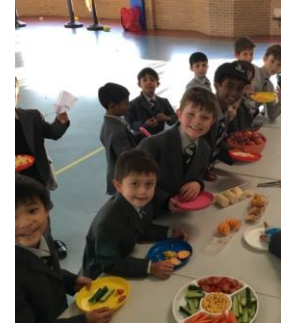
The children lining up for afternoon tea

Happy Week 7 everyone! We finally received our order of dodgeballs and we have been playing dodgeball almost every afternoon as the boys love it! It is a fun activity as we have both the boys and the staff joining in. We also received more Lego which is exciting for the junior boys as they love their Lego. Vacation Care is fast approaching and we are in the midst of planning a fun packed program for all to enjoy.