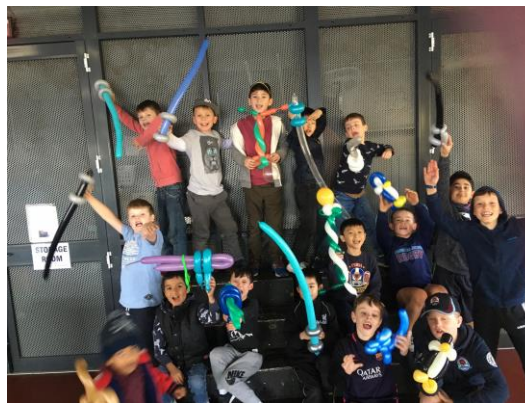
Some of the kids at our Winter Vacation Care

Our spring vacation care is now available for bookings through our iportal page. Make sure you get in quick as spaces are limited for our excursion and incursion days. Excursions these holidays include a trip back to Skyzone and bowling!