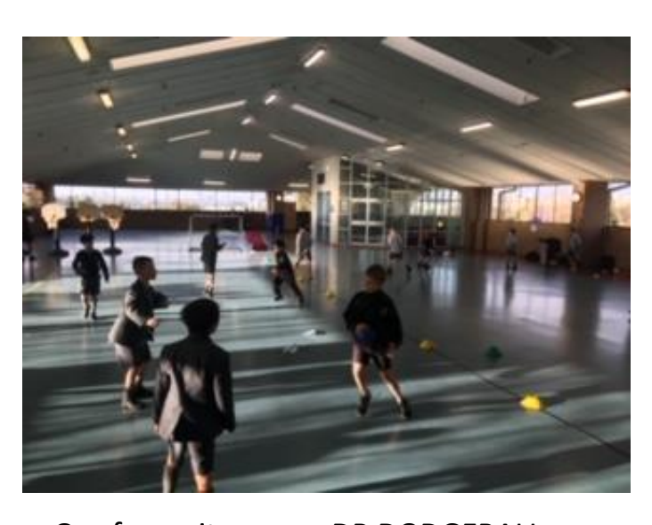
Our favourite game: DR DODGEBALL