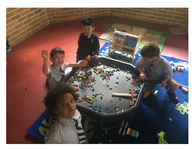
Younger boys LOVE their Lego!