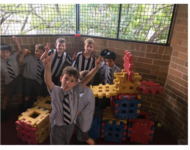
Building fortes with our waffle blocks